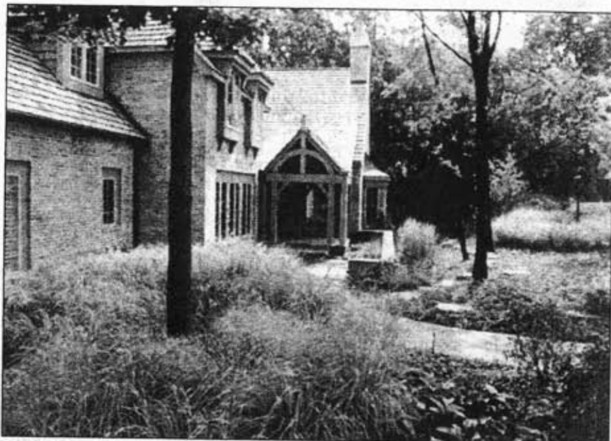
Van Zelst received the Associated Landscape Contractors of America grand award for its landscape construction of this Barrington Hills residence.

ciation representing approximately 1,200 landscape contractors from the United States and abroad. ALCA's Environmental Improvement Awards Program is designed to reward landscape contracting professionals who execute high quality landscaping projects and to recognize project owners who underwrite such work.