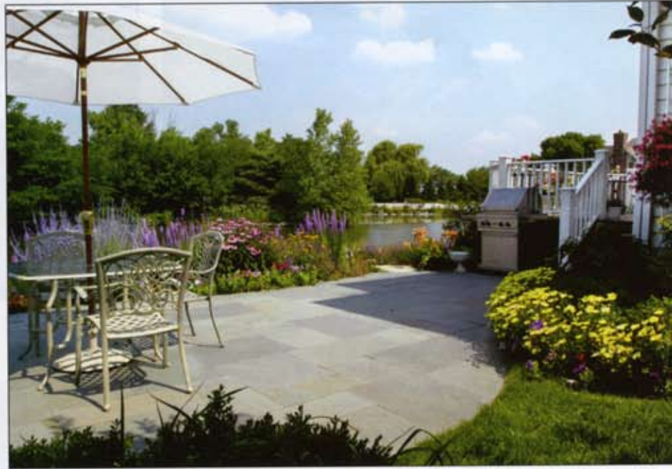
The deck affords easy access to the bluestone patio, surrounded by flowers throughout the growing season.

A new bluestone patio on the side of the yard offers another space to enjoy the garden. Amita says she enjoys both areas for entertaining or quiet reflection. "It's very romantic in the evening to watch the sunset." The Sharmas also savor their morning tea on the deck in the summer.