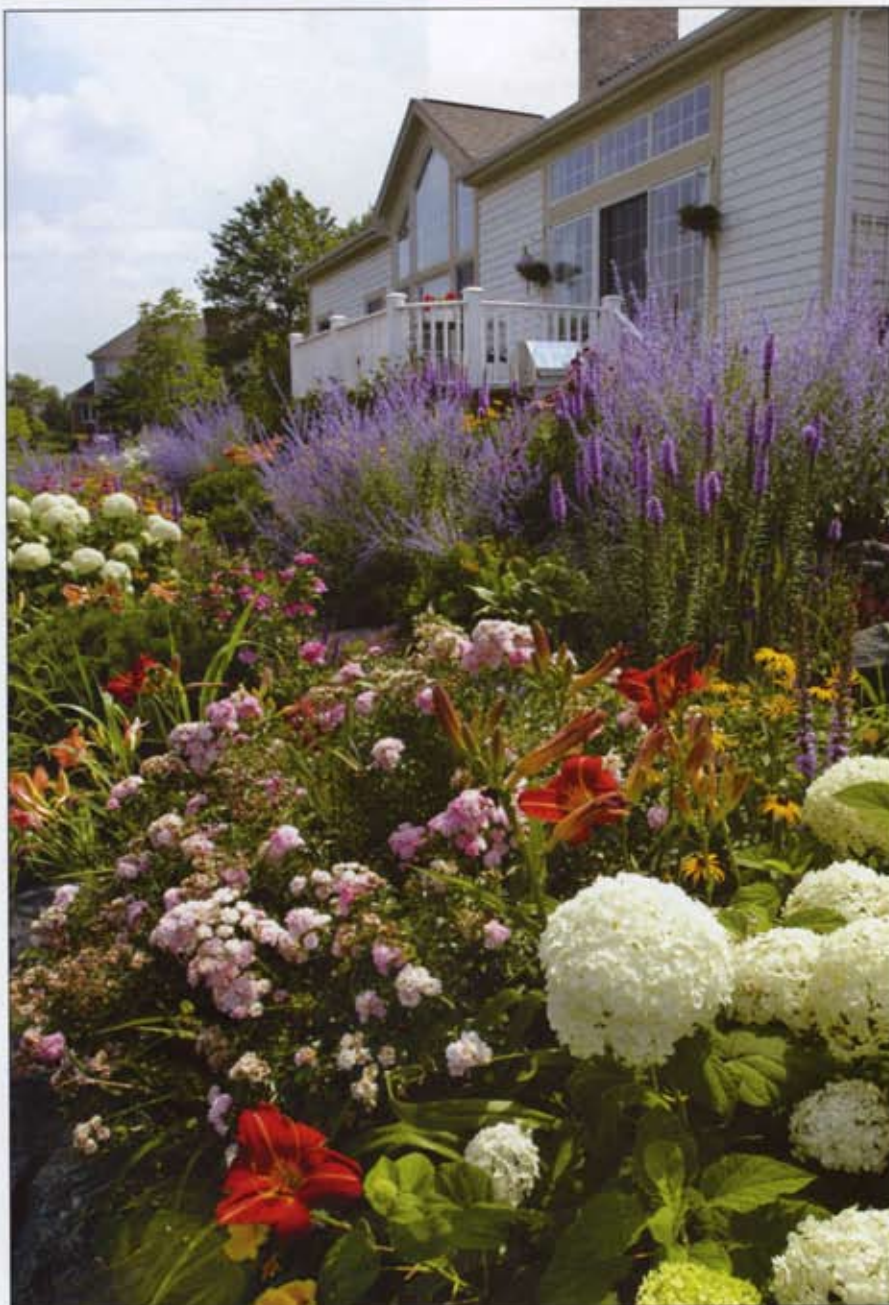
Whether looking up, down or around, the Sharmas enjoy a colorful garden planted with perennials and shrubs.

Van Zelst notes that the shoreline was also threatened by erosion. “One of the first things we did was put in a boulder retaining wall,” he says. Gun-metal granite boulders were sited along the shoreline and then planted with ground-hugging plants such as euonymus ( E. fortunei ‘Coloratus’) and plants with long taproots like