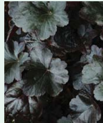
Heuchera Obsidian Smooth, jet-black leaves add a deep luster to shady areas.