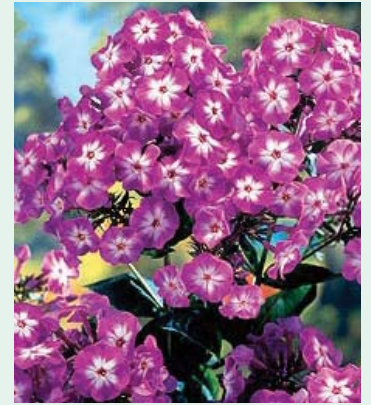
Phlox Laura Purple petals with white eyes add light and fragrance.