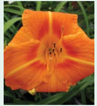
Hemerocallis Tuscowilla Tigress Long-blooming, huge orange flowers—up to 7"—with gold mid-ribs.