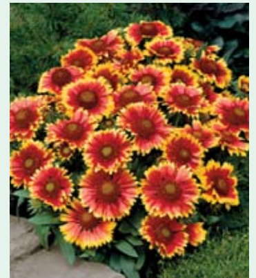
Gailardia Arizona Sun Abundant, long-lived blooms in unbelievable color.