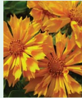
Coreopsis Jethro Tull Brilliant, fluted petals provide high impact in a compact space.

Take a look at some of the incredible new plants we're incorporating this year: