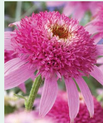
Echinacea Pink Double Delight Knockout double-blooms that bloom for 8 to 12 weeks.